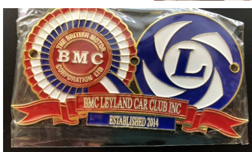
New Grille Badge