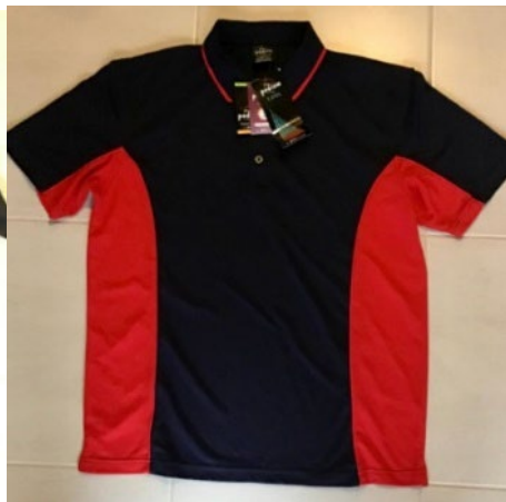
Club Polo Shirt