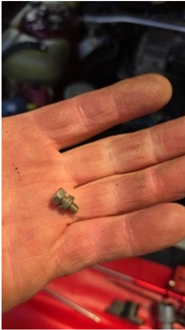
Left: The culprit.