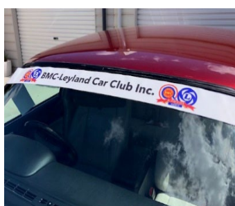
New Club Banner