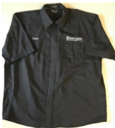
Club Dress Shirt