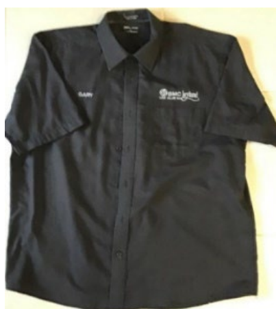
Club Dress Shirt