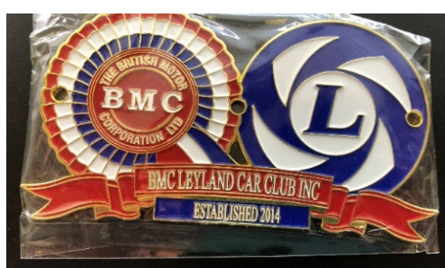
New Grille Badge