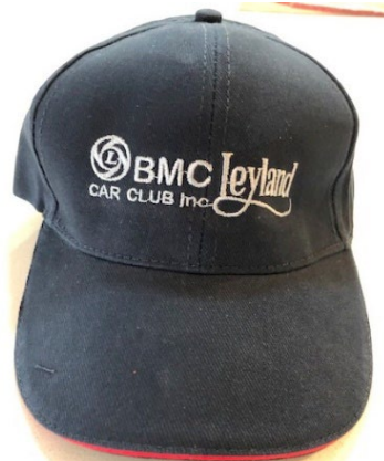
Club Caps - navy or black