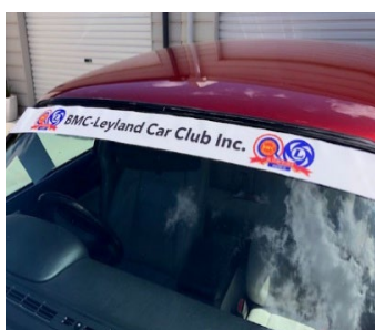
New Club Banner