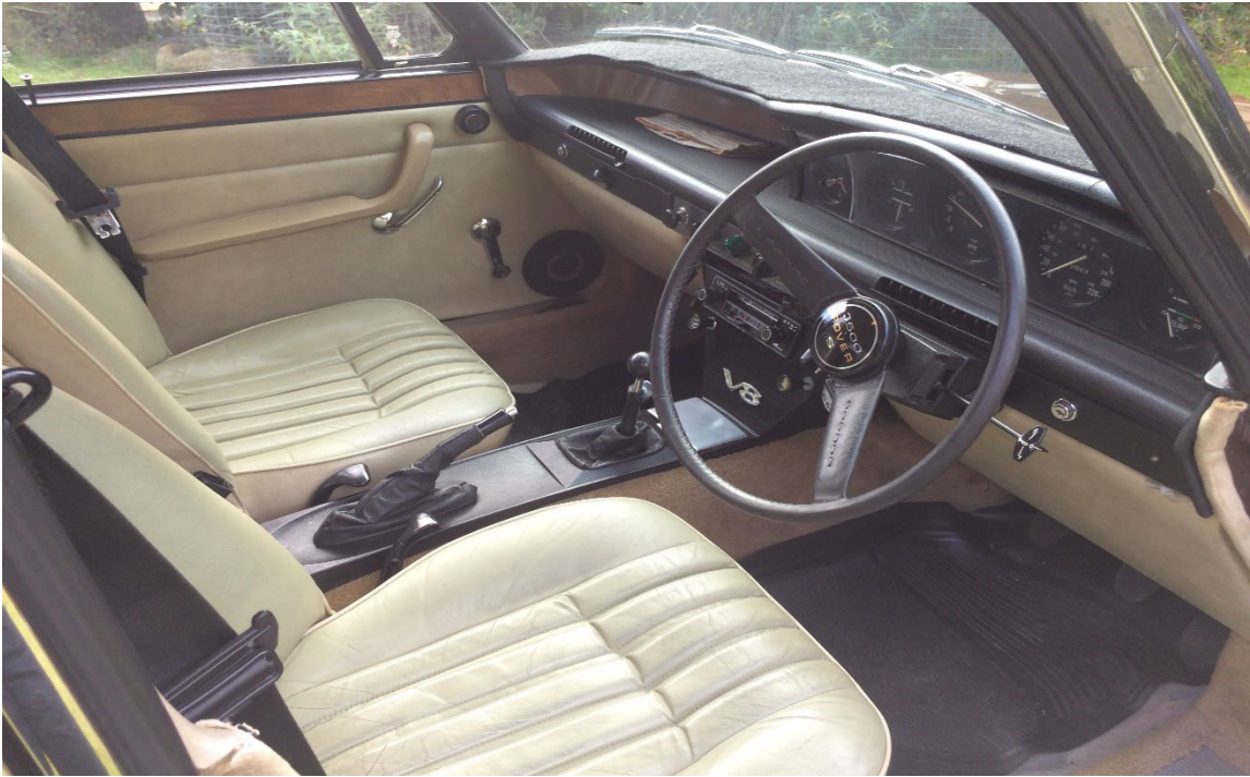
The luxurious and refined interior of the Rover 3500 S